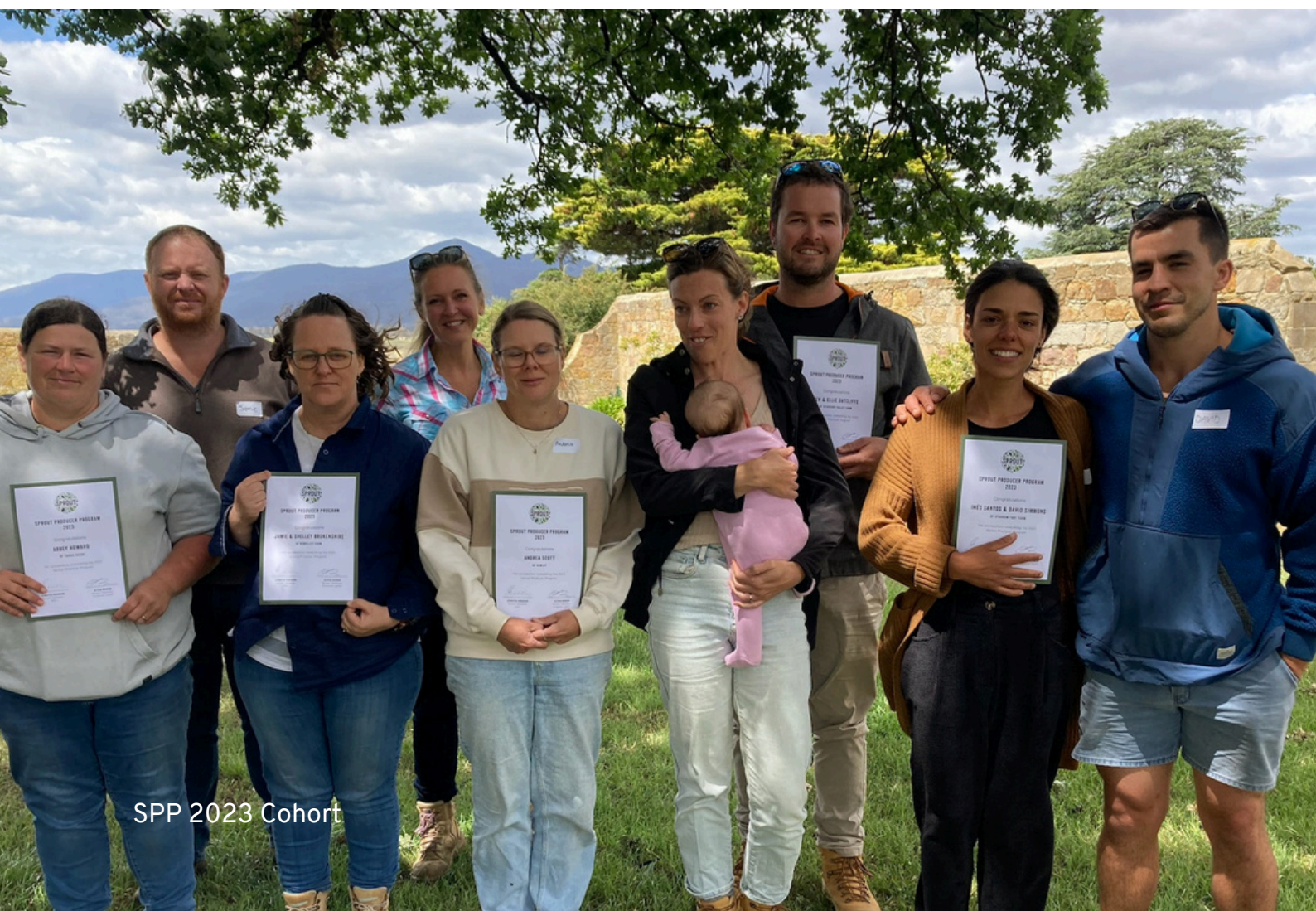
SPP 2023 Cohort

2024-25 is shaping up to be another great year for the program, with more adaptation to come!